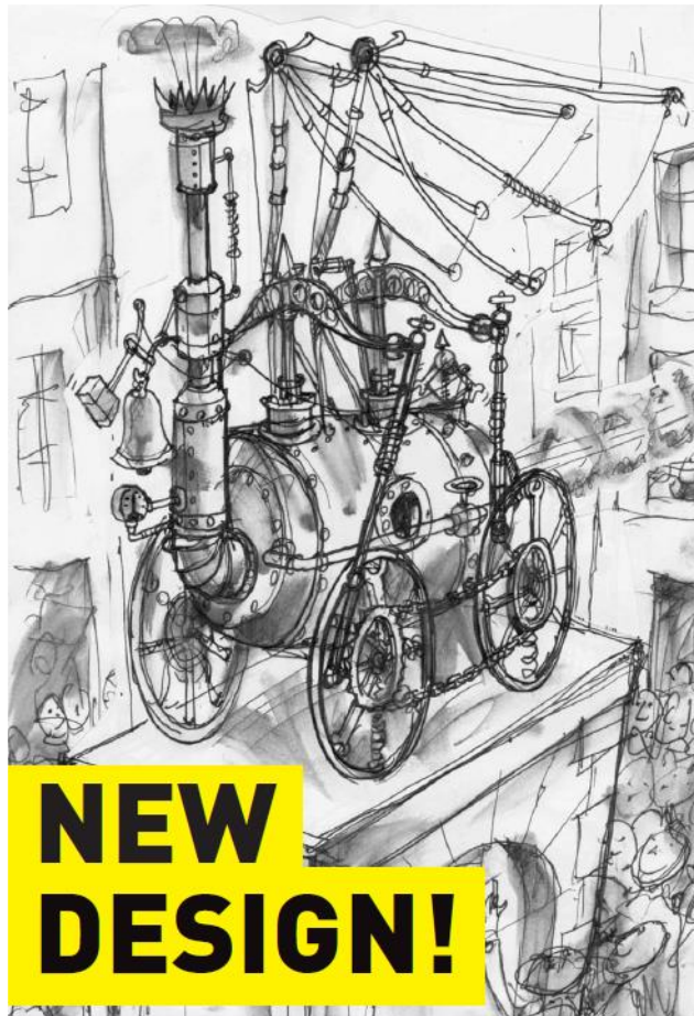
Artist's impression of the Stockton Flyer automaton