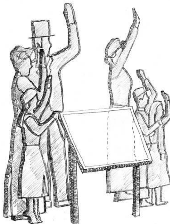
Artist's impression of the interpretation panel near St John's Crossing