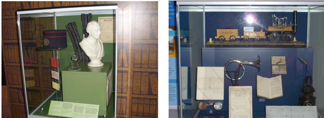
Display cases at Preston Hall Museum