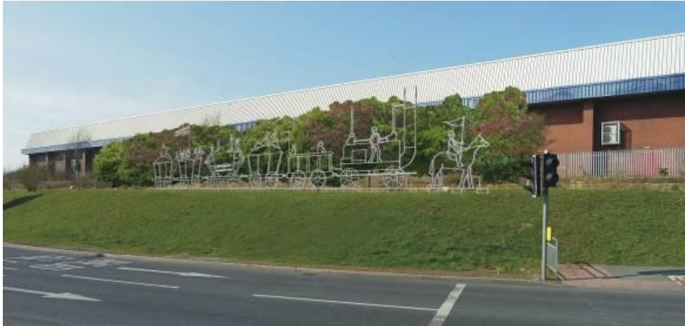
Projected view of installed artwork from Bridge Road side