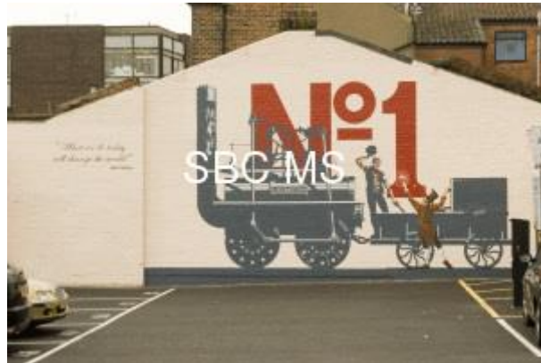
Mural at Bishop St Car Park

original terminus of the Railway. Painted in 2005 by local artist Zac Newton the mural is a popular feature and has recently been refurbished. The mural also references the invention of the friction match and features a quote from George Stephenson, 'What we do today will change the world'.